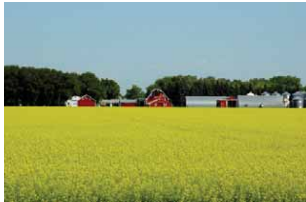
Farmers are a significant part of the Lake Huron community, and are helping to improve water quality by implementing Environmental Farm Plans.

By participating in the Environmental Farm Plan Program, farmers see their farms in a new light. The program helps them to both identify environmental problems in their operations and develop plans for improving their farms' environmental footprint in the future. Farmers in the counties near the Lake Huron shores are strongly committed to managing their land in a healthy and sustainable way for the future.