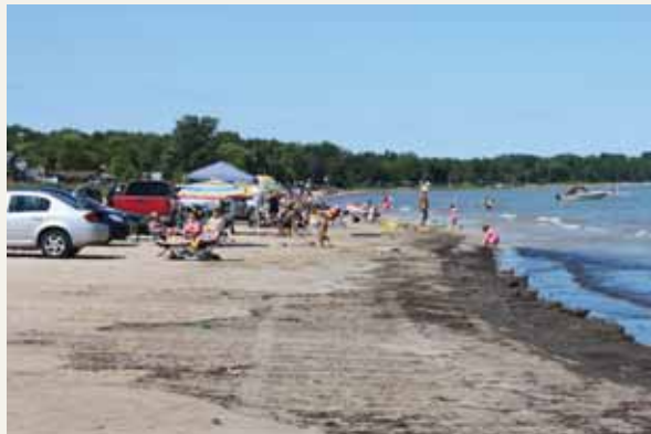
Enjoying Ipperwash Beach.

Once the information is collected, we will be developing recommendations. These will be shared with the community and will form the basis for efforts to seek funds to help address water quality and aesthetic issues along the Lambton Shores beaches.