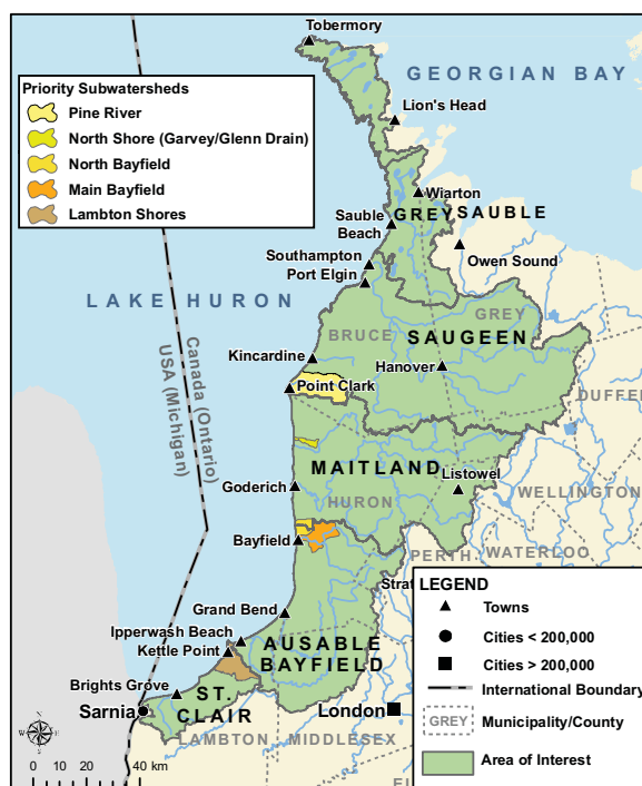
A map of the Southeast Shore Area of Interest.

Keeping up with what's happening in the southeast shore will be very easy, very soon! This is the first issue of what will become a bi-annual newsletter in the region. A website is also being developed to help inform community members, create a dialogue and form future partnerships. The website will be up and running by early fall 2011, and will be located at www.HealthyLakeHuron.ca .