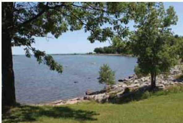
The Lake Huron shoreline near Kettle Point.

The Ausable Bayfield Maitland Valley and the Thames-Sydenham and Region Drinking Water Source Protection Committees have worked cooperatively with